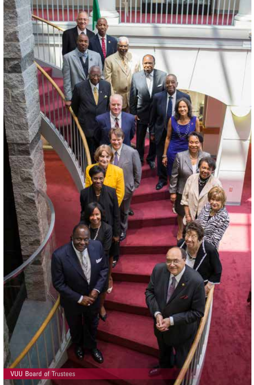
VUU Board of Trustees

Dr. Wyatt T. Walker '50, '53 (Trustee Emeritus)