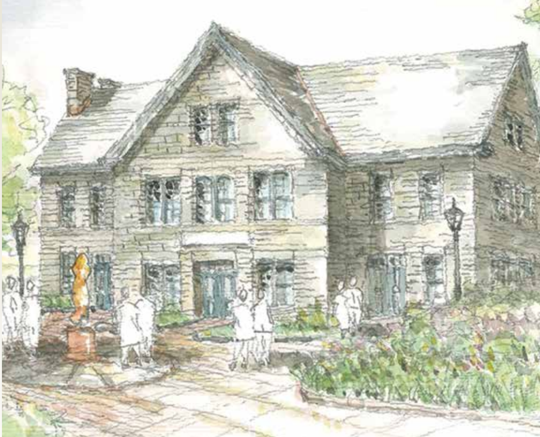
Artist Rendering of Industrial Hall for VUU Museum Art Galleries

On October 1, 2015, the Virginia Union University Board of Trustees approved the following master plan projects under consideration for the next five to ten years: