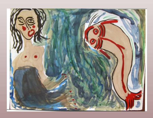
Lady Swims with the Catfish