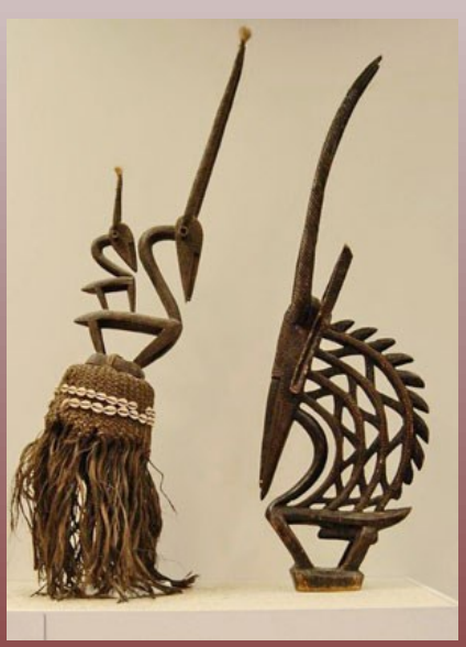
Chi Wara Masks