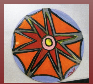
Eight Point Star, 1992