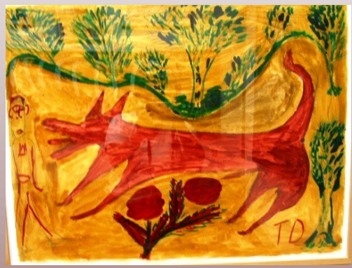
A Man in the Hills