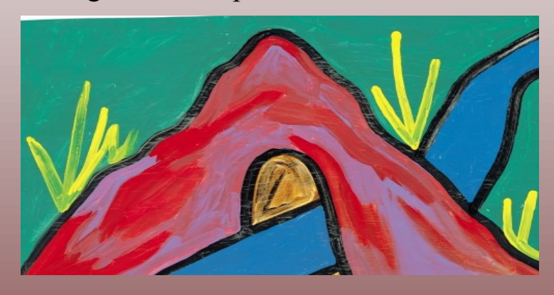
Blue River Mountain, 1987