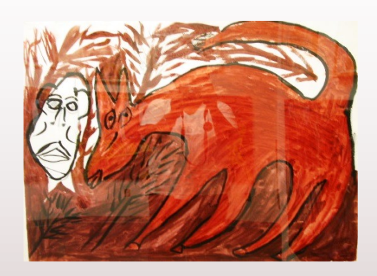
The Man Loves His Mule