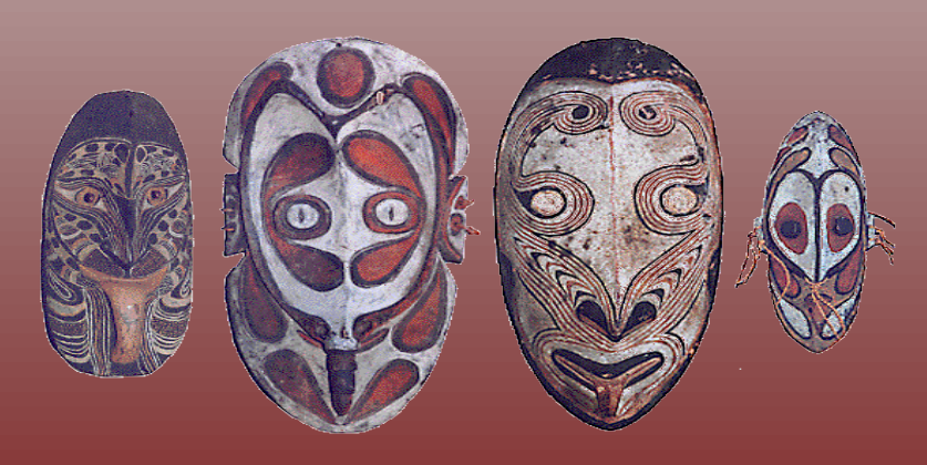
Carved Wooden Masks

There are similarities between this art and the art from Africa. Much of this art is ceremonial regalia supporting the tradition that religious beliefs govern ceremonies.