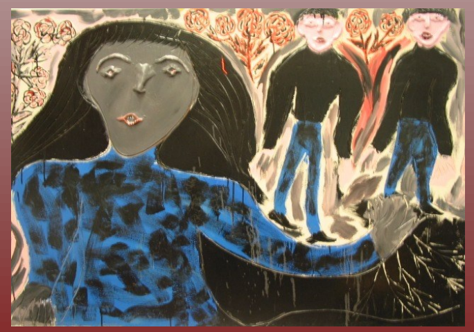
A Woman Holds Up the Man