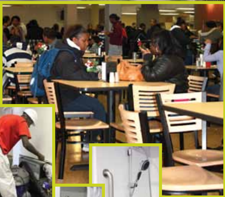
The remodeled student cafeteria has improved the dining experience for VUU students. White Hall has been converted into a handicapped-accessible residence hall for female students.

SINCE 1865 VIRGINIA UNION UNIVERSITY HAS BEEN A BEACON FOR EDUCATIONAL EXCELLENCE. IN ORDER FOR VUU TO CONTINUE ITS LEGACY OF EXCELLENCE, YOUR SUPPORT IS CRUCIAL. CONTACT THE DIVISION OF INSTITUTIONAL ADVANCEMENT AT 804.342.3938 OR USE THE ENVELOPE IN THIS ISSUE FOR YOUR CONVENIENCE.